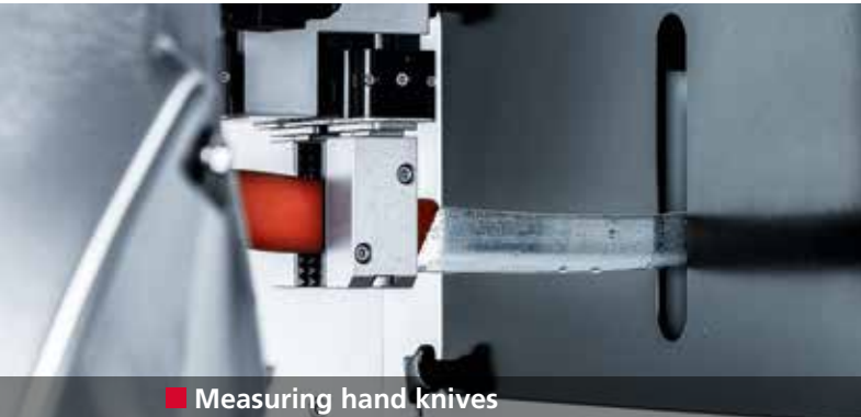
■ Measuring hand knives

Robotic technology provides perfect ground hand knives