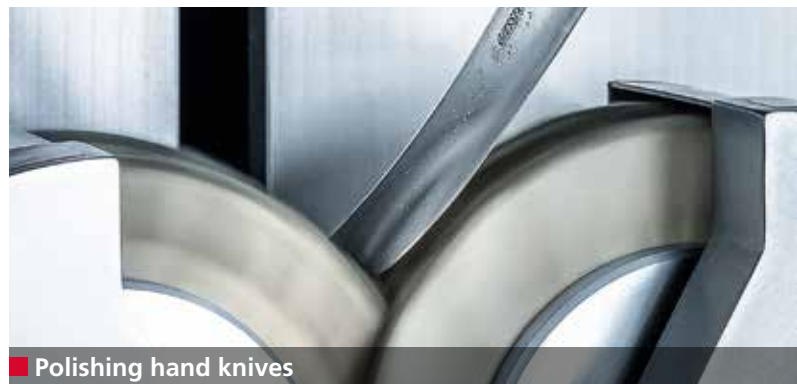
■ Polishing hand knives

The E 50R sharpens hand knives of various shapes and sizes fully automatically.