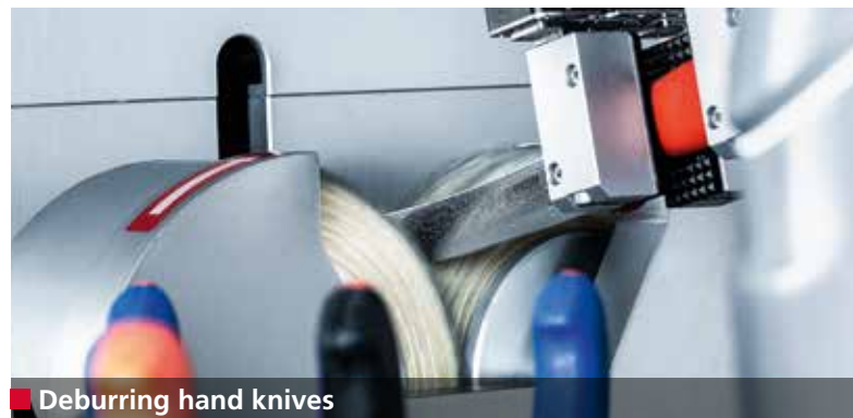
■ Deburring hand knives

Precise cuts optimize the product quality