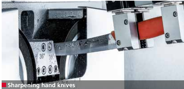
■ Sharpening hand knives

Perfectly ground hand knives enable more accurate cuts. Hand knives, ground with the E 50R robotic technology, increase the yield of meat up to 0,5 % compared to manual grinding. At 10 000 tons meat production, this means a 50 000 kilograms higher rate of yield.