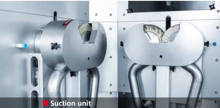
■ Suction unit

Completely encapsulated machine with suction unit and water cooling