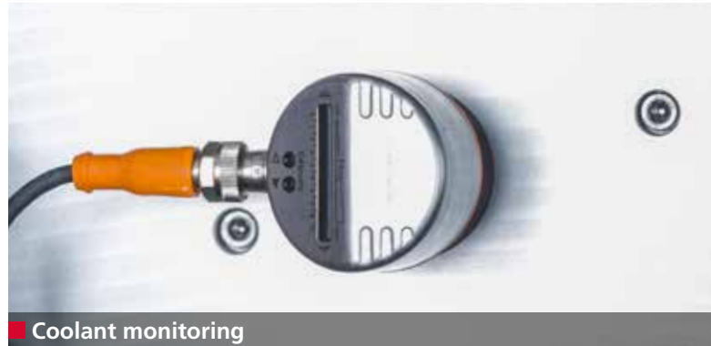
■ Coolant monitoring

The serial suction unit and the water cooling considerably reduce all emissions arising from sharpening and polishing. This protects the operator's respiratory system.